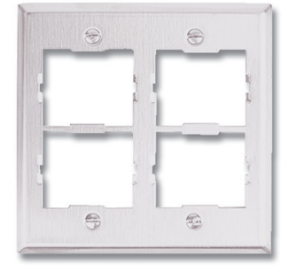
CT8-FP-SS ..... Double gang stainless steel faceplate for four couplers

CT8-FP-SS-L.... Double gang stainless steel faceplate for four couplers with labels and label holders